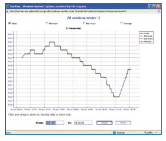
Graphical presentation of log.